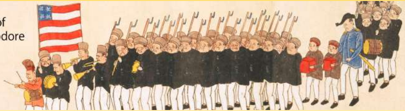
Arrival of Commodore Perry