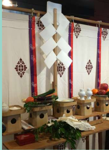
House blessing was performed for a home in Hawaii Kai on 5/18.

The House Blessing aims to "feed" the house, show proper treatment and respect to it to create a sense of peace, balance and harmony.