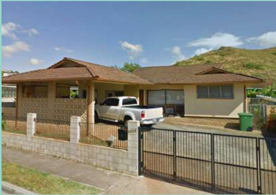
Annual House Blessing performed for a home in Moanalua on 5/6.