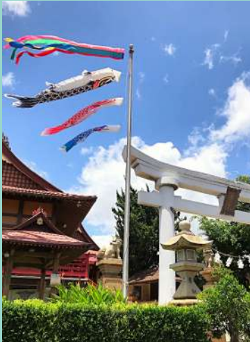
Koinobori carp streamers billowing in the breeze, heralding the arrival of Tango no Sekku or Boy's Day.

Kashiwa mochi , a mochi wrapped in oak leaves is eaten on May 5 to ensure a year of good health.