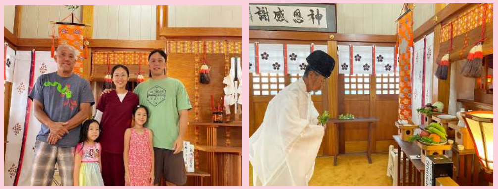
A 25th year and a 1-year Remembrance ceremonies were performed for shrine friends.