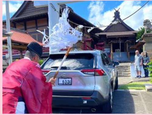
A Car Blessing was performed for two dear shrine friends