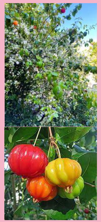
It's Surinam Cherry season again. The shrine's cherry tree is full of fragrant white flowers!!!

Hakkyaku An or eight-legged stands are ancient pieces of furniture, made of wood and used in shrines and temples.